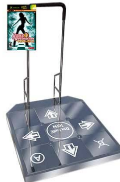
Twin Dance, Dance Revolution! With BIG SCREEN PLAY!