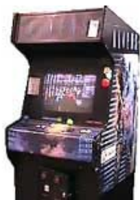
Pac-Man, Aliens, Golden Tee Golf and MANY more arcade games!