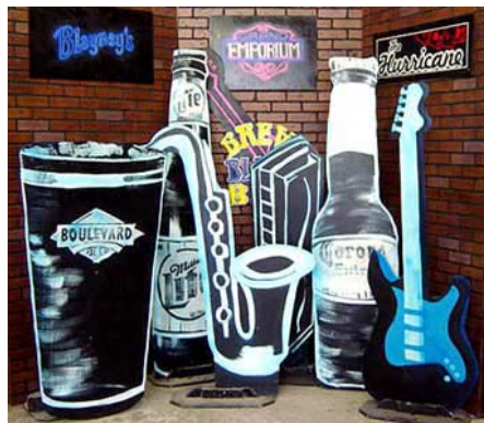
Blues & Jazz Décor much more available...