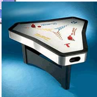
3-Person and Standard Air Hockey Tables!