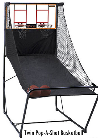
Twin Pop-A-Shot Basketball