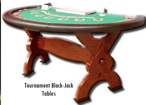
Tournament Black-Jack Tables