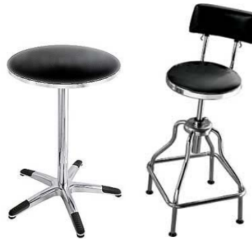
Leather Cocktail Tables & Chairs