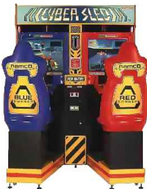
Twin Cyber Sled Command