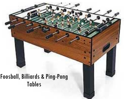
Foosball, Billiards & Ping-Pong Tables