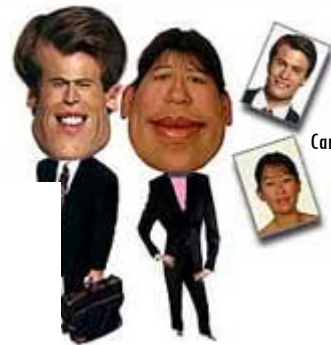
Caricature Studio Photo Booth with take-home photos!