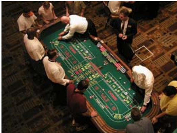
Casino Quality Craps Tables