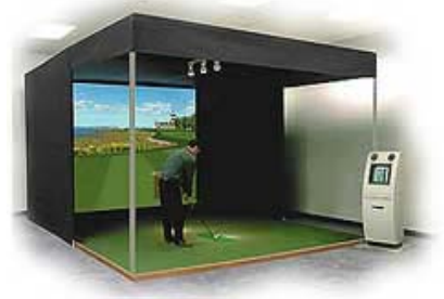
Virtual GOLF and Putting challenges!