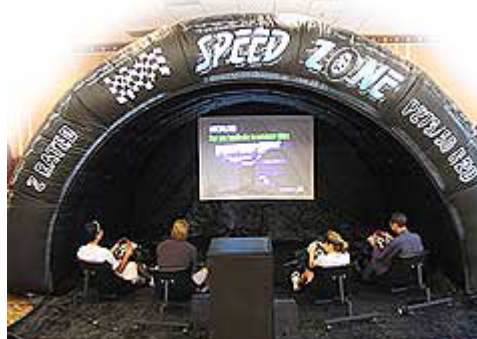
4-Driver Grand Prix Racing with BIG SCREEN PLAY!