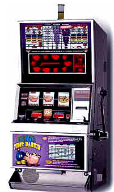
New LED Triple Roller Slots 2-Fun Games In One!