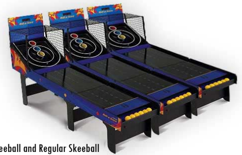
Basketball Skeeball and Regular Skeeball