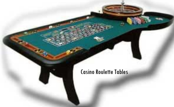
Casino Roulette Tables