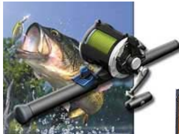
Virtual Deep-Sea Fishing