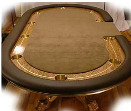
Tournament Poker Tables