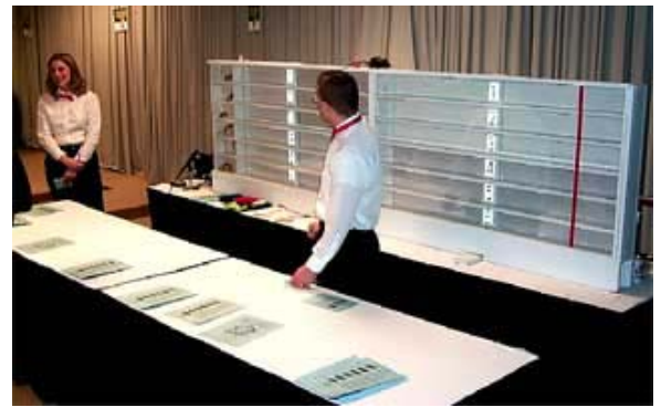
Rodent Run For The Roses with Master of Ceremonies!