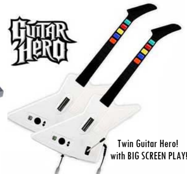
Twin Guitar Hero! with BIG SCREEN PLAY!