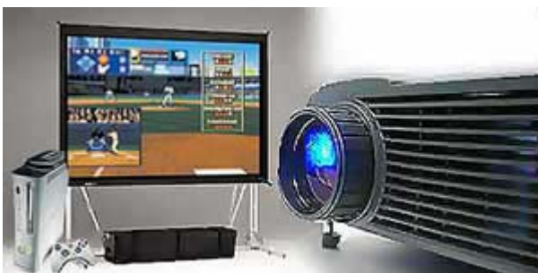
Virtual Baseball, Bowling, Boxing & Tennis with BIG SCREEN PLAY!