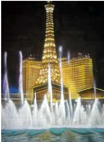
Casino & Las Vega Backdrops