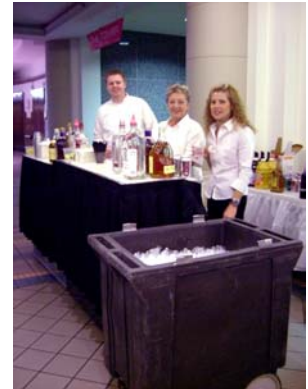
Portable Wet Bars