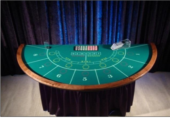
BACCARAT ULTIMATE TABLE

Baccarat (also known as punto banco) is one of the oldest and most popular casino games in the world. Although the game seems serious and elegant, it is really as simple as betting on the flip of a coin.