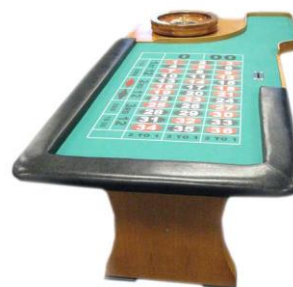
TOURNAMENT GRADE ROULETTE TABLE