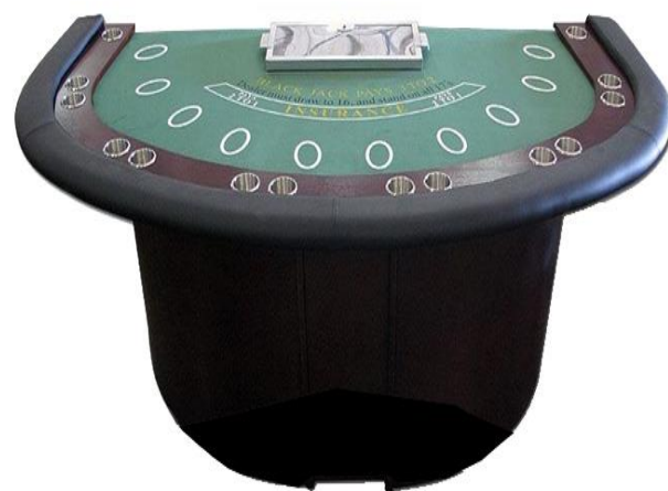
ABOVE: "ULTIMATE" GRADE BLACKJACK TABLE

equal to 1 or 11. Face cards are 10 and number cards are face value. The player calls "hit" to get a card or "stand" to end their turn. A player can also "double down" their bet and may only receive one card. If a player has two identically numbered cards, they may "split". They double their bet and receive more cards making 2 new hands they play. After all players turns are over, the dealer reveals their card. The dealer then hits if the total is 16 or less and stands on 17 and higher. Everyone who has a hand that beats the dealer without going over 21 wins.