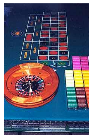
PARTY GRADE ROULETTE TABLE