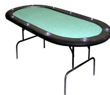
"PARTY" GRADE POKER TABLE