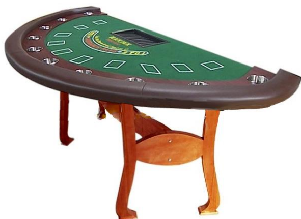
"TOURNAMENT" GRADE BLACKJACK