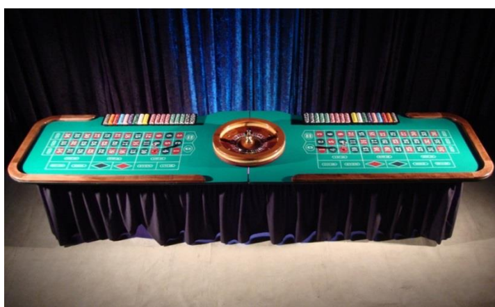
DOUBLE RIGHT AND LEFT HAND TOURNAMENT GRADE ROULETTE TABLE