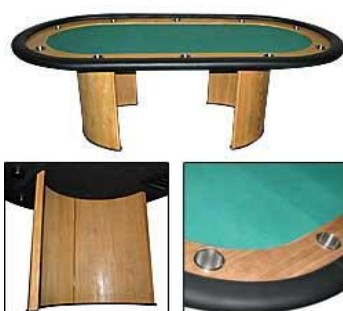
"DELUXE" GRADE POKER TABLE