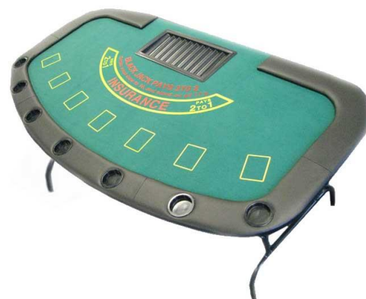
"PARTY" GRADE BLACKJACK TABLE