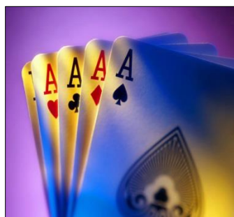
REAL CASINO CARD DECKS