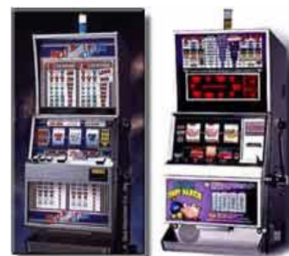
"ONE ARM BANDITS"