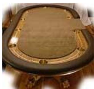
"TOURNAMENT" GRADE POKER TABLE