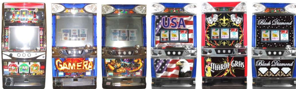
SKILL STOP EURASIAN PACHISLO SLOTS

The most widely used casino game is slots . Slots are all about entertainment and machine makers have done their best to produce games that entertain and make you happy. As the saying goes, if it makes you happy, it can't be that bad! Take away the risk of loss and the movements and sounds make for a great fun time. Two styles of slot machines are available, Eurasian Pachislo skill stop slots and the more expensive, but, more well-known USA "one-arm bandits"