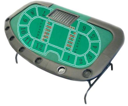
BACCARAT PARTY TABLE

Baccarat (also known as punto banco) is one of the oldest and most popular casino games in the world. Although the game seems serious and elegant, it is really as simple as betting on the flip of a coin.