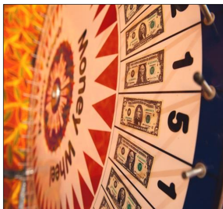
BIG 6 MONEY WHEEL