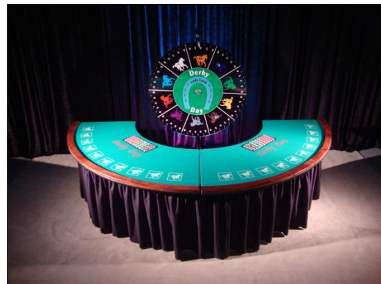
DERBY DAYS HORSE RACE WHEEL

The Money Wheel is the easiest casino game and a good option for less serious players. The object is to simply pick a number on the wheel. Your odds depend on how often that number is shown on the wheel. A number of variations exist, from the standard BIG 6 to DERBY DAYS.